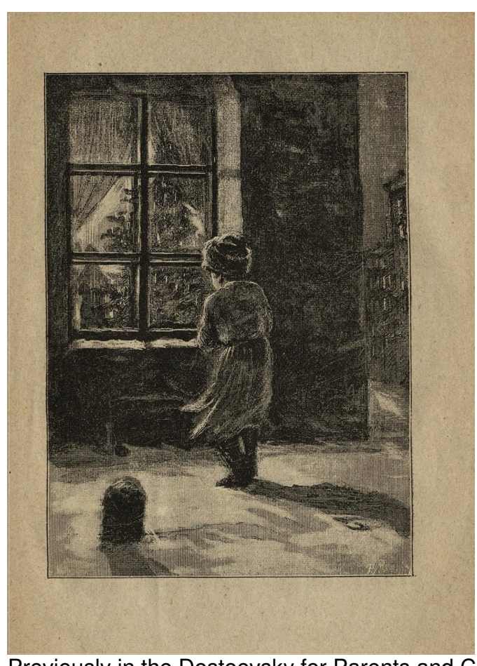
Previously in the Dostoevsky for Parents and Children series:

Varenka's Memoirs (from the novel Poor Folk, 1846 [1883, 1887, 1897, DPC I])